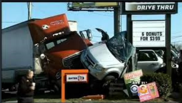
Multiple Vehicle Accident