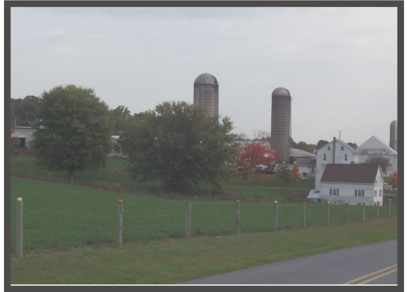
Farm in the Governor Mifflin Area

Land use is only one aspect of planning; however it is an extremely important one. Land use is the alteration of the natural environment into man-made or built environment and includes lands which are undisturbed by man. Development regulations, physical restraints and highway networks all contribute to the land use patterns within a region. Land use is used as a tool for evaluating current zoning and subdivision and land development policies as well as provides guidance for future development. Land use helps evaluate public needs, potential environmental impacts as well as prevents potential conflicts. Municipalities utilize land use planning to balance development and preserve natural resources. It serves to guide official decisions regarding the distribution and intensity of private development, reinvestment in urban centers and capital improvement programs.