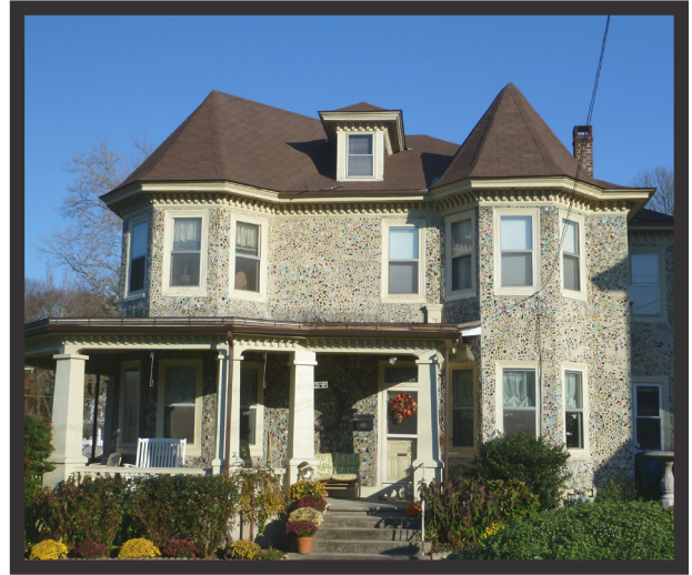
House in Mohnton Borough